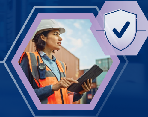
Supply Chain Resilience