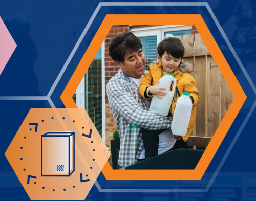
Circular Economy and Sustainable Supply Chains