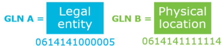
Figure 4-1 One GLN identifies one party or location example

As an organization expands, additional parties, functions, or locations can be allocated new GLNs. If a party, function, or location is discontinued, it can be removed from use with minimal impact to other GLNs.