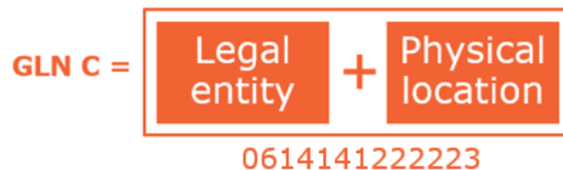
Figure 4-2 One GLN identifies a combination of party and location example

However, using this allocation method may result in issues when scaling to meet business needs or when trying to achieve more complex use case requirements.