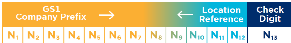
Figure 3-1 GLN data structure