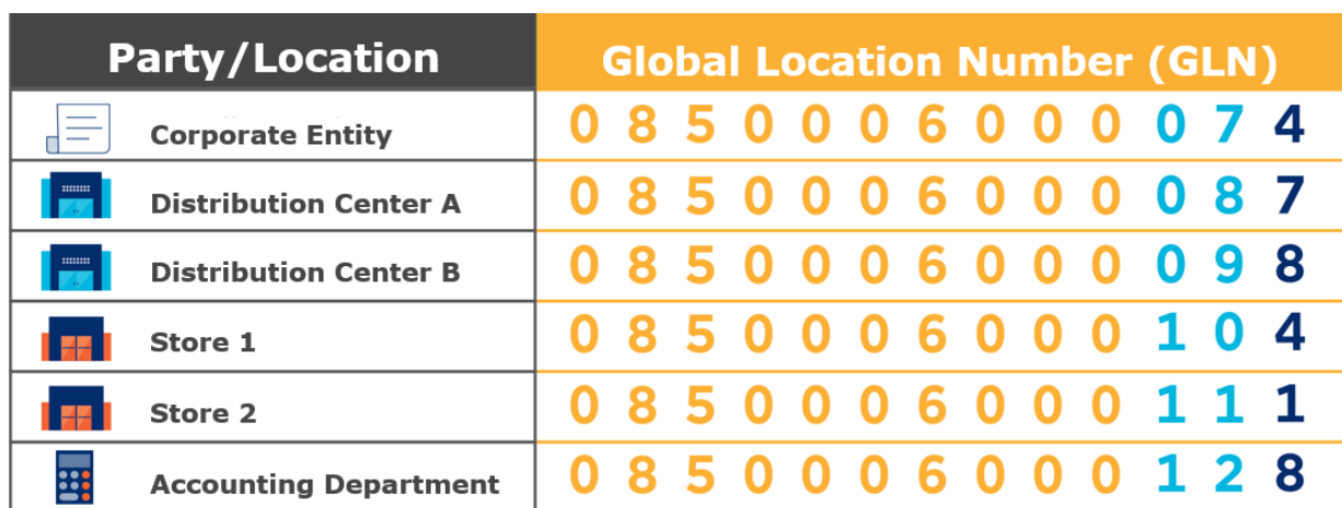
Figure 6-1 GLN hierarchy example

The below is an example of what a GLN hierarchy may look like. Each party and location that needs to be identified in business transactions has a unique GLN allocated to it. The hierarchy will vary based on what is being identified.